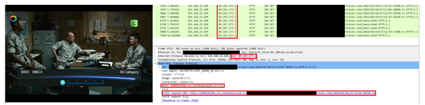
Example of Screenshot and PCAP Evidence Sent to Datacamp about the Istar Pirate Service's Use of Datacamp's CDN to Illegally Transmit the MBC Kids (MBC3) Channel

56. DISH and the Networks in response to Datacamp's requests provided more information about the Pirate Services, including evidence of infringement taking place on Datacamp's servers in the form of screenshots of transmissions of the Works and network traffic recorded in the form of PCAP files, showing that Datacamp's servers were responsible for the infringing transmissions on the Pirate Services.